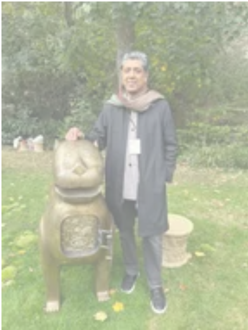
Vikram Goyal Soul Garden at Design Miami Paris.